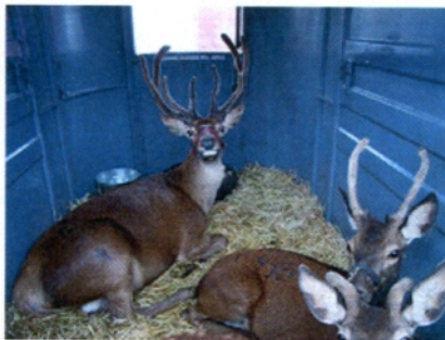
Prancer and Vixen being lazy as usual. Geesh someone get them a Starbucks. (Half photobomb by Rudolph bottom right.)