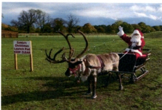
Rudolph getting some practice time at the farm. He always gets Santa practice time. To be honest, a few of us are jealous!