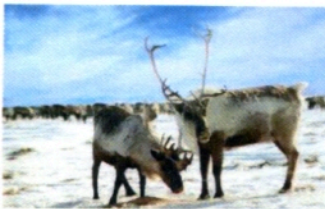
Dancer and Donner chilling in the fields. These two are ALWAYS together!

It's that time of year again and boy have we been busy. In preparation for our long trip around the world we wanted you to see what's it's like as we prepare for Christmas over here in the North Pole, and also provide a few tips we want our friends and family to know.