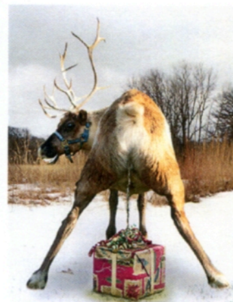
We have no idea what Blitzen is thinking. We promise this is NOT where your ribbon comes from!