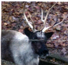
Comet being the kiss butt as always. Posing for the camera. Geesh. Talk about a brown nose!